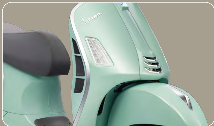
GLOSSY AND BRILLIANT METALLIC COLORS, WITH AN EYE TO THE VESPA TRADITION AND TO THE FUTURE