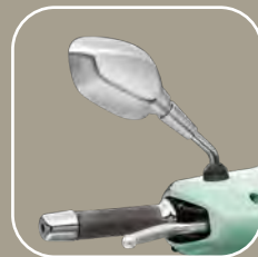
CHROME PLATING THAT ADD ELEGANCE AND BRILLIANCE